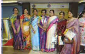
Installation on July 6th