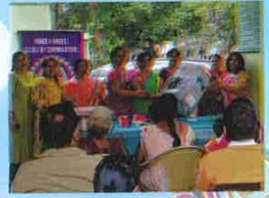
World Polio day at Meenakshi Maternity Home Water Purifier was Donated