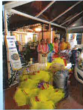
We Donated Rs.50,000/- worth Materials for Kerala Flood Relief