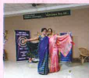
Get together with west club