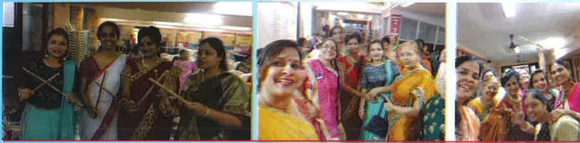
Navarathri Celebration at Gujarati Samaj