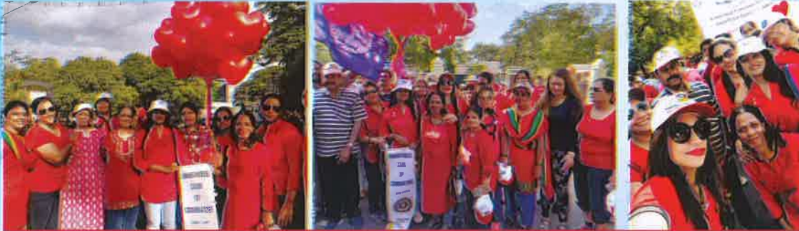
World heart day Walkathon with GKNM Hospital Rotary