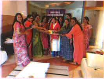
Chartered accountant day