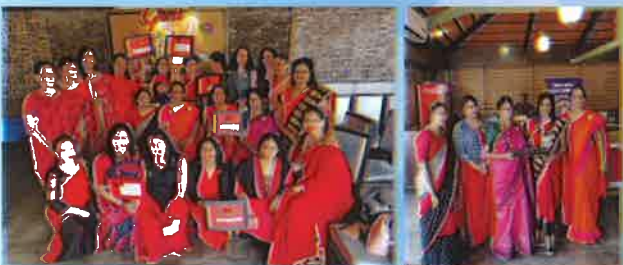
Valentine's day Celebrations.