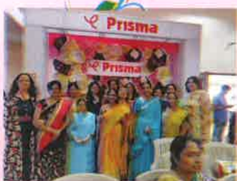
District Rally Dollar 18 at Tiruppur