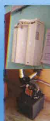
Two Tanks, a motor and an Aqua Guard were donated to Corporation Municipal School in Kavundampalayam During Chairman's visit