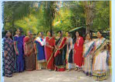
Medical Camp at Anaikatty tribal village with PSG College of Nursing