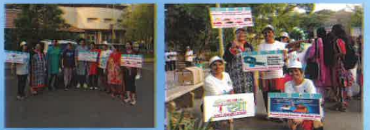
Cervical awareness walkathon in association with Rao Hospital followed by breakfast at Cosmo Club