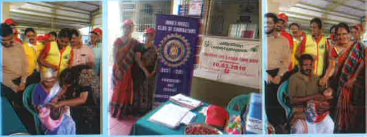
Pulse Polio Immunisation done at Seethalakshmi hospital on March 10th in the presence of Commissioner and Deputy Commissioner