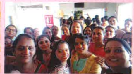
Joint meet with Sister Clubs