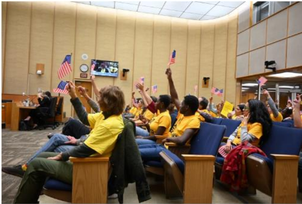
Southwestern residents waving American flags in unison during public comment to advocate for the removal of Footnote 7, Tuesday January 28.

By Macy Meinhardt, Jan 30, 2025 SHARE THIS: f X v @