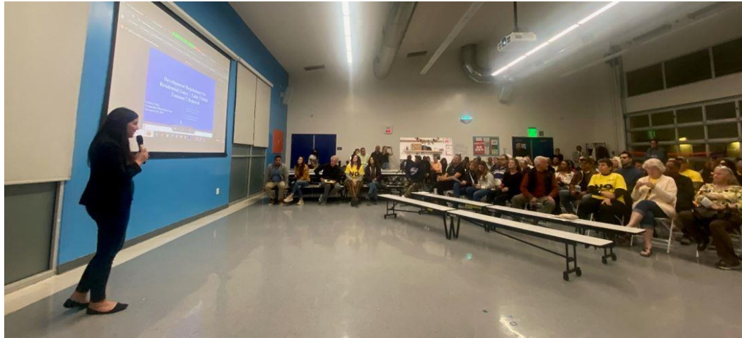
Director of City of San Diego Planning Dept at CVCPG meeting of November 18, 2024