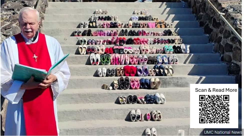
United Methodists confront Iran war's impact