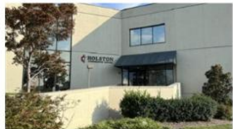
Annual Conference votes to sell home office building