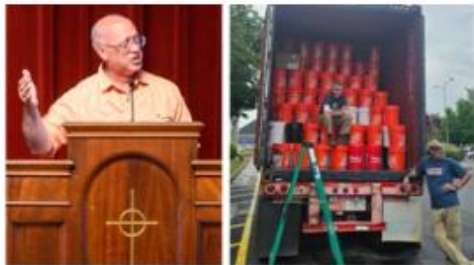
Holston churches give $78,000 to mission projects, send 3,582 kits to Liberia