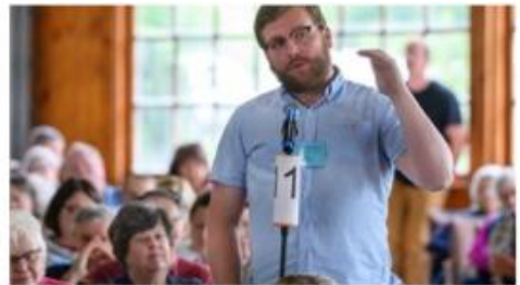
Annual Conference approves resolution upholding human dignity for immigrants