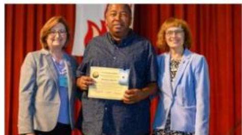
Holston celebrates achievements in evangelism, education