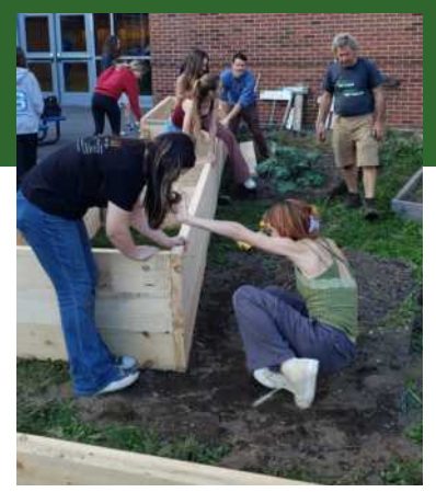
ANNUAL REPORT 2023

In 2023, we introduced tiered pricing for all our on-the-farm educational programs for children and adult workshops. This new pricing model offers three price points for all programs, including reduced pricing. This program is voluntary and individuals choose the tier that best suits their financial situation.