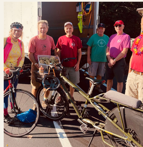
Photo: Fresh harvest delivery to Weymouth Food Pantry during recent Carrot-by-Cycle ride.

In 2023, we added weekly deliveries to Weymouth Food Pantry, Interfaith Social Services (Quincy), a housing unit in Boston, Cohasset Food Pantry, and Hingham Food Pantry. And, we continue to deliver to Wellspring (Hull), and Scituate Food Pantry.