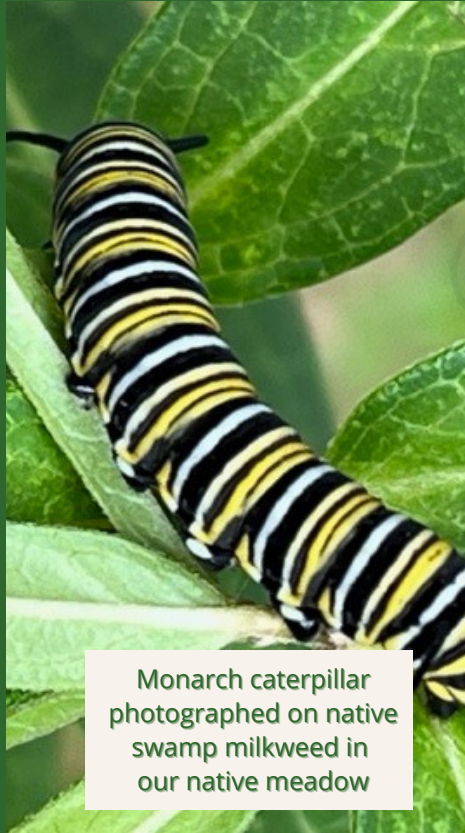
Monarch caterpillar photographed on native swamp milkweed in our native meadow

With member support and with the help of dozens of adult and teen volunteers, we have created a native meadow that survived its first critical winter (and the grazing deer), and attracted adult monarch butterflies who deposited countless eggs on new crops of native swamp milkweed ( Asclepias Incarnata ) plants.