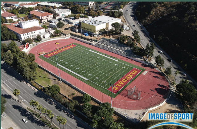
Glendale Community College Stadium