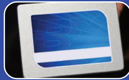
Solid State Drives