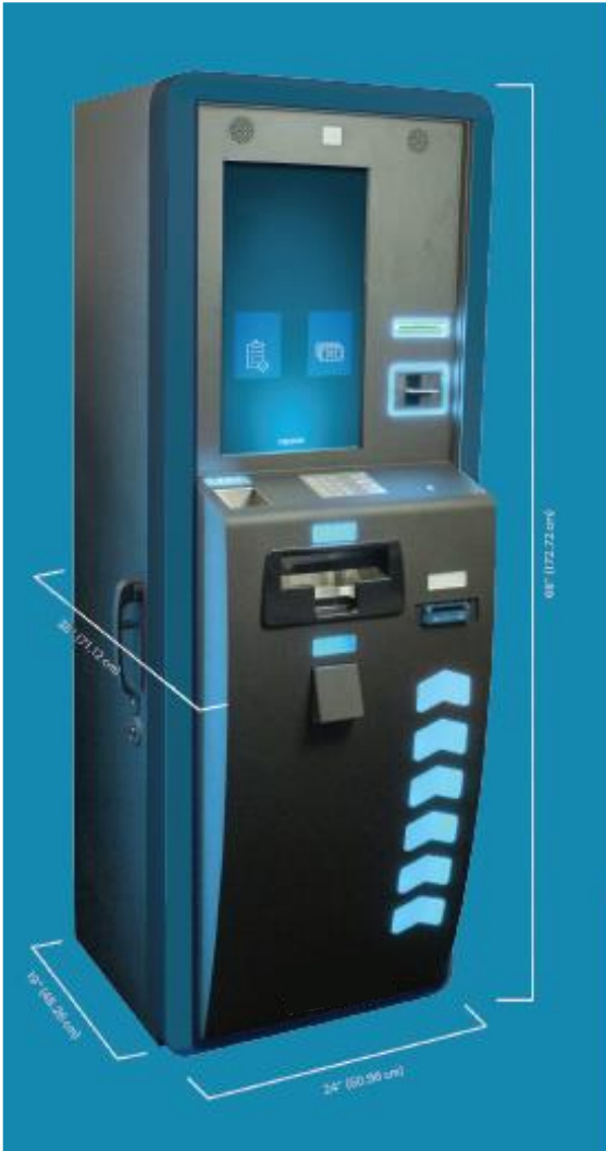
Dimensions without activity Light on Top

Height = 68 Inches / 172.72 Centimeters Width = 24 Inches / 60.96 Centimeters Depth = 28 Inches / 71.2 Centimeters Weight = 900 lbs. / 408.22 Kilograms