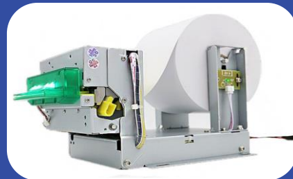
Long-Life Receipt Printers