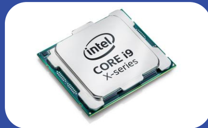
Powerful CPUs for Biometric Processing