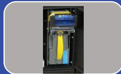
Country Configurable Cash Acceptance and Dispensing Units