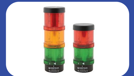
Activity Pole Display