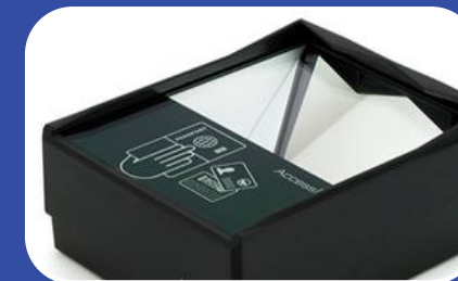
ICAO Certified Passport and Credential Reader