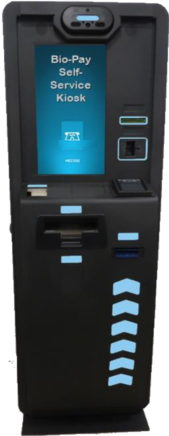
Unit Shown with Motorized Face Height Adjustment Camera And 10 Fingerprint Capture System

Customers that use Biometric ATMs in Asia tend to complete one to two transactions more per month than the average. This increases usage, which will drive revenue for issuers, through fees or other services. Our Kiosks/ATM enhance security. ATMs are the primary target of debit card fraud. 85% of U.S. debit card fraud comes from compromised ATMs (*Forester Research).