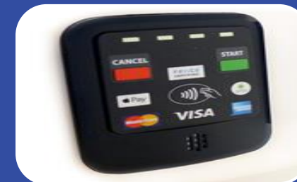
NFC Card or Tag Readers