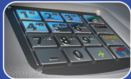
High Endurance ADA compliant Braille Keypads