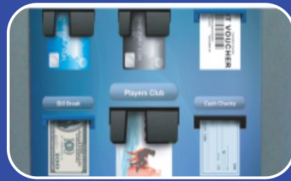
22" HD Color Touch Screen