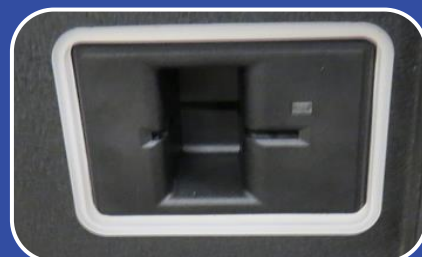
EMV Certified Magnetic Card and Smart Card Readers