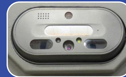
Motorized Height Adjustment Face and Dual Iris Camera