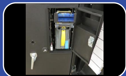
Double Secured Latching Cabinet with Doors