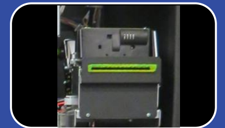
Secure Visa Ticket Printer