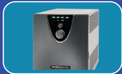
Battery Back-up and Power Conditioning