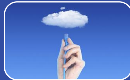
24/7 Cloud Monitoring System