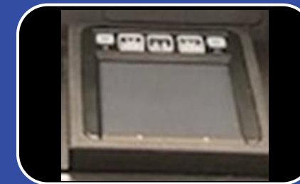
10 Digit FBI Certified Fingerprint Capture Module