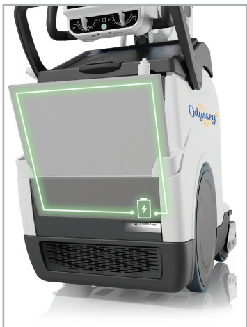
Detectors can be charged on board in the units charging slot.