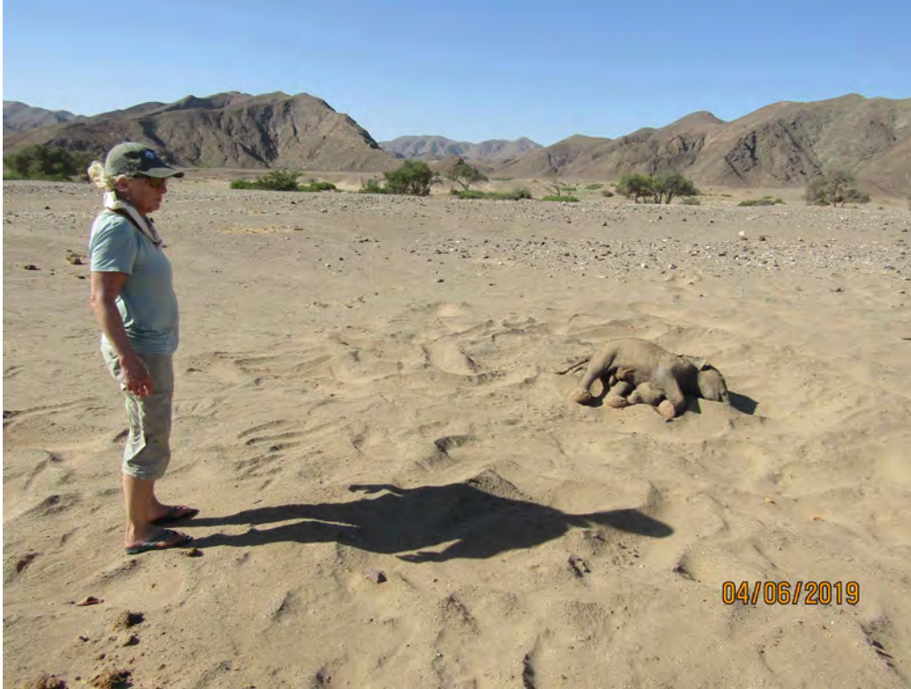
Figure A2. Seven elephant calves were born in Hoanib River between Jan-May 2019. Three died shortly after birth and one was removed for captive-rearing when his mother died suddenly. Three were alive and well in the Hoanib River as of end 2019.