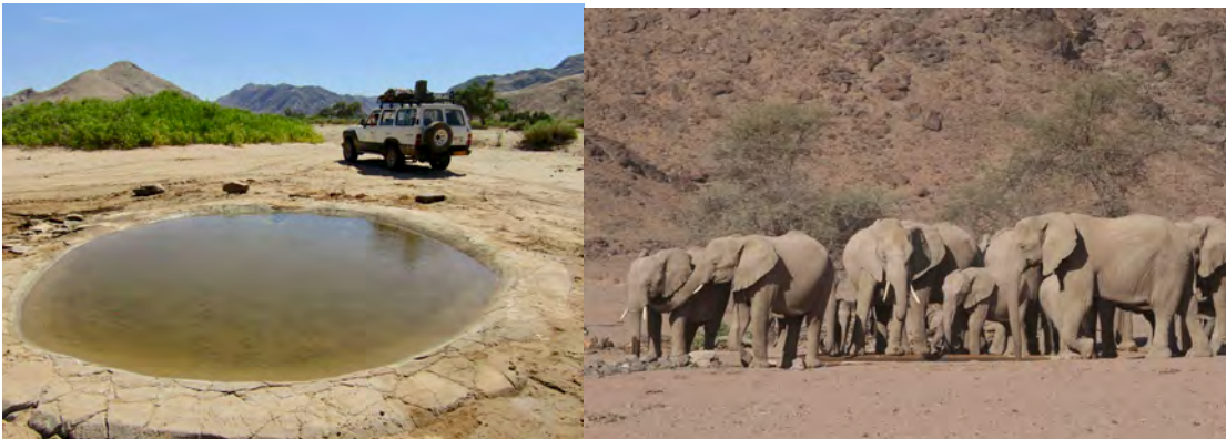
Figure A5. Boreholes are critically important for desert elephant survival in the Hoanib River. Both the borehole at Natural Selection's Hoanib Valley Camp and Wilderness Safaris Hoanib Skeleton Coast Camp provide valuable drinking opportunities for the resident breeding herd and supplement the Presidential Boreholes. Tourism at these camps and others nearby lead to increased protection for the elephants and other wildlife, as well as jobs and income for people in the local communities, adding value to wildlife.