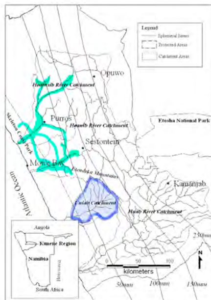
Figure A1: Map of the approximate home range of Hoarusib-Hoanib (green) and Uniab (blue) elephant subpopulations. Migration routes between the Hoarusib and Hoanib are indicated by the connecting lines. Mean annual rainfall is portrayed by isoclines. These are the same subpopulations as studied by Viljoen (1987, 1988), with occasional, temporary movement outside these home ranges, as described by Lindeque and Lindeque (1991).