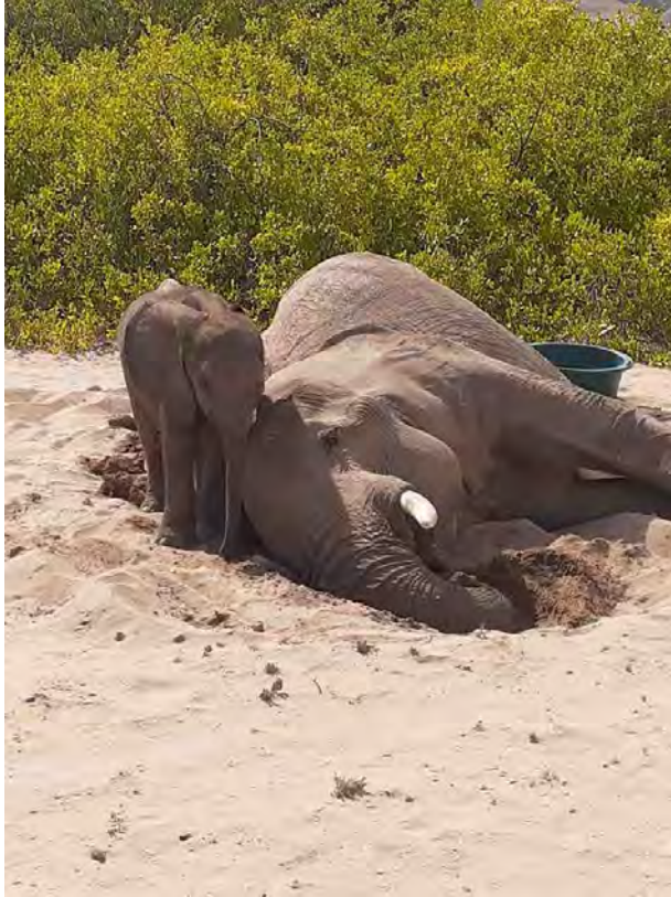
Figure A4. WKF-11 (Enforcer) died 24/12/19 in Hoanib near junction of Obias Valley. Her male calf WKF-11/a4 (Goliath) was rescued by authority of MET and transferred to Okutala Etosha Lodge for captive-rearing.