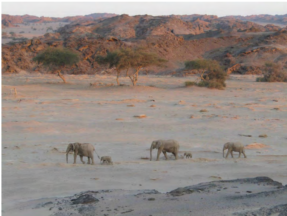
Figure A3. Two of the three surviving calves born in Hoanib in 2019.