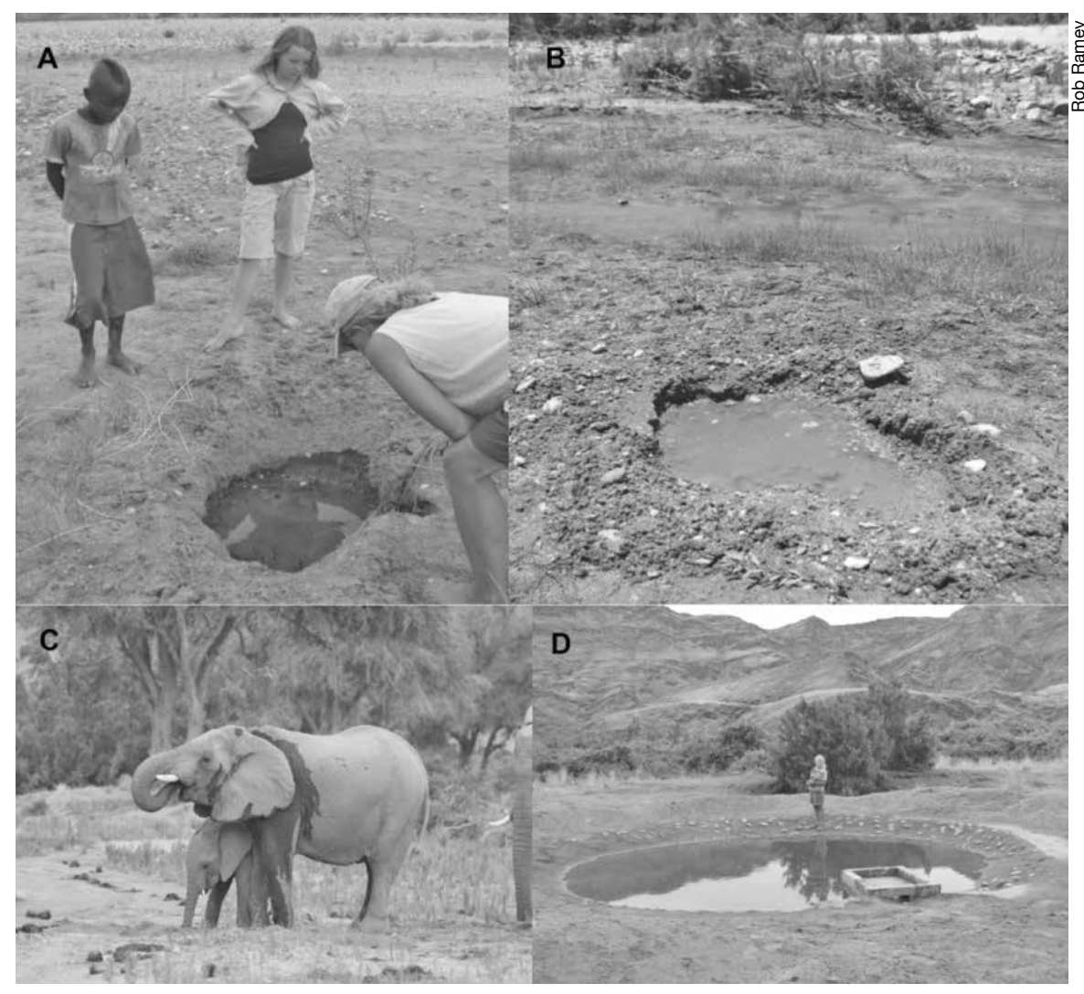
Figure 1. A . Shallow well dug by an elephant in a dry section of the Hoarusib River. B . An elephant well immediately adjacent to surface flowing water in the Hoarusib River. C . Elephants drinking from an elephant well in the dry bed of the Hoanib River. D . Artificial drinking pool at the East Presidential borehole, Hoanib River.

and trunks in the dry sand of the riverbeds where groundwater nears the surface. These 'elephant wells' are up to 1 m deep (Figure 1a–c), and are used not only by elephants but by numerous other species as well, for example, springbok, jackals, baboons. Curiously, elephants will go to great lengths to dig wells immediately adjacent to free-flowing surface water or pools, rather than drink from those readily available water sources (Figure 1b). This behaviour is not unique to desert-dwelling elephants and has