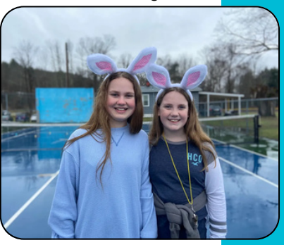
Hoppin' into Easter with gratitude. A big shoutout to our amazing volunteers who made the celebration egg-stra special!