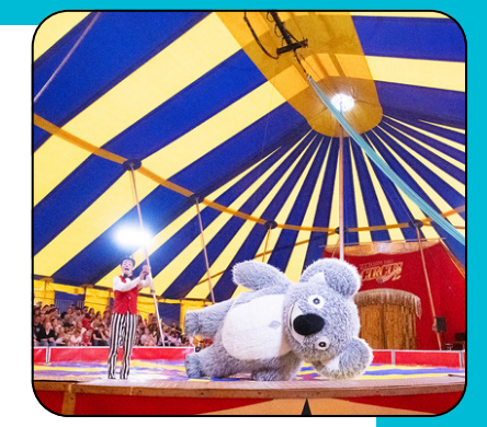
Step right up! A day of wonder, laughter, and jaw-dropping performances when The Zerbini Family Circus came to town – fun for all ages!