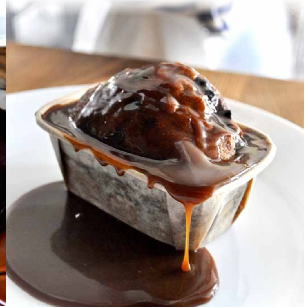
salted caramel banana bread w/ fresh cream and choc chips $6.50