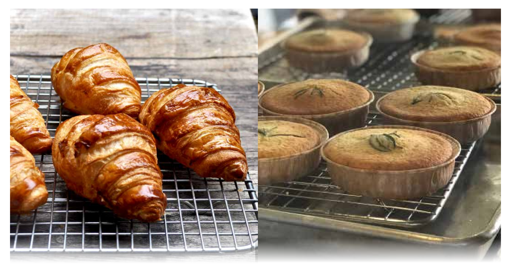
freshly baked croissants made with french aop butter $1.90ea $10.00 ½ doz