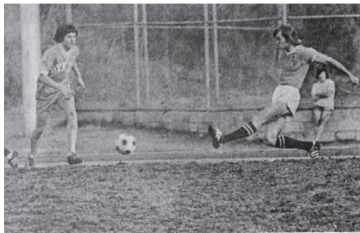
Lakeside vs. Henderson 1972