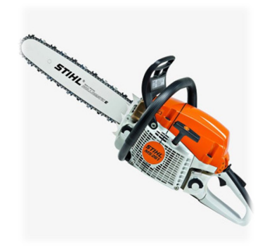
Mowing – Weed Eating – Tree, Bush Trim / Removal Leaf & Property Clean Up – Flower Beds and Mulch Pressure Washing – All Your Outdoor Needs Want it Done Right? Call Us Day or Night!