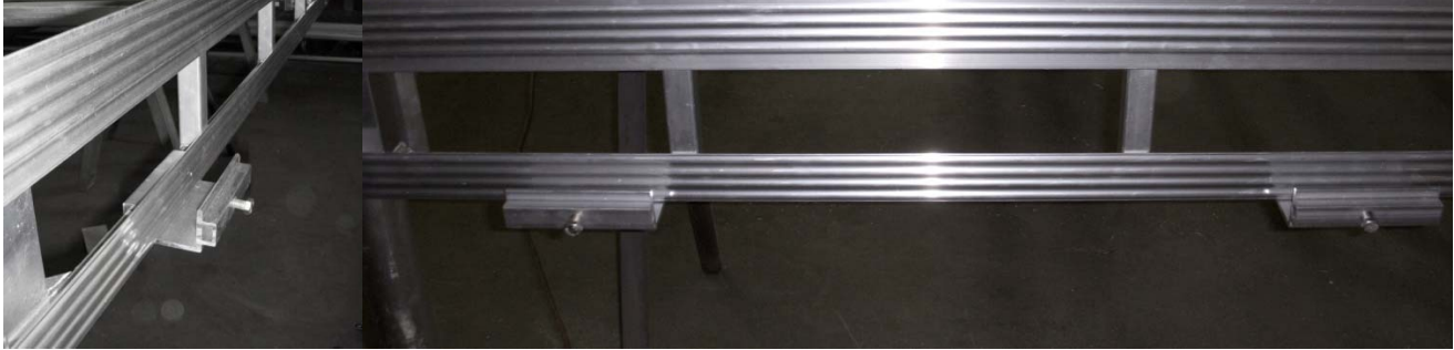
**If attaching corner sections make sure you place 2 dock locks on each side of the corner.**

8. Place 2 dock locks on the bottom rail of dock #1. Then add dock #2 into the dock locks. The fit should be tight. Make sure the tops of each dock are level with each other. Tighten bolt to 10-15 ft/lb. DO NOT OVERTIGHTEN.