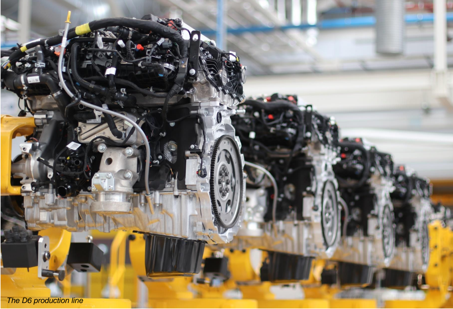
The D6 production line