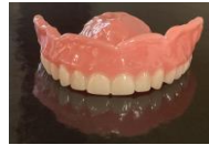
Printed Try-in or Wax Try-in