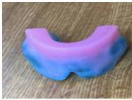
Bite Rim for VDO

You can also scan the impression to start a digital case