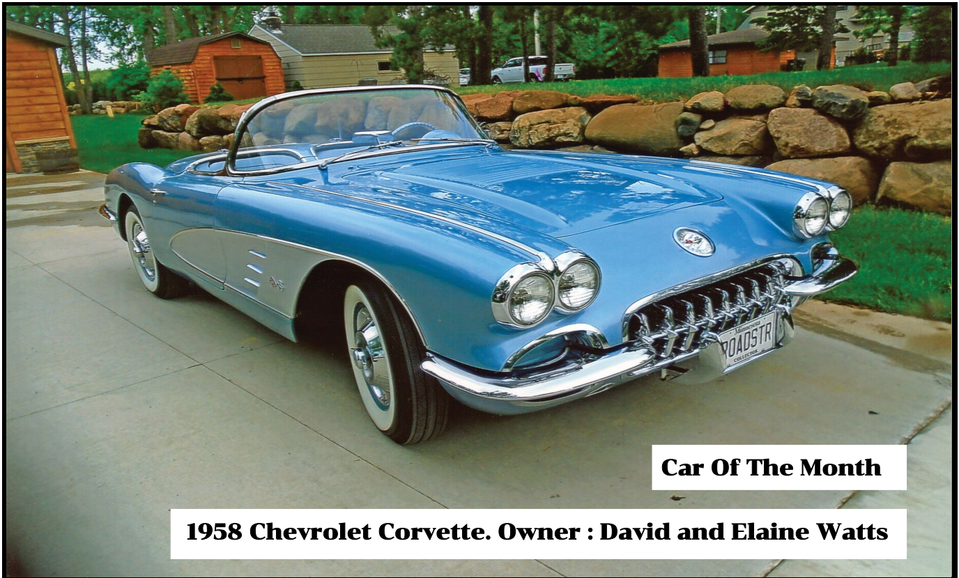
Car Of The Month