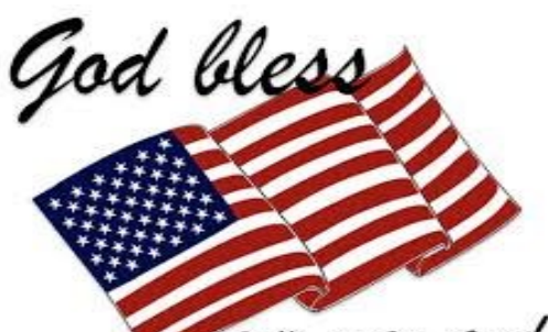
women in service