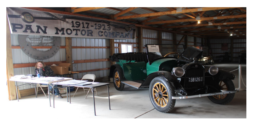
Pan on display at Pioneer Days This Year