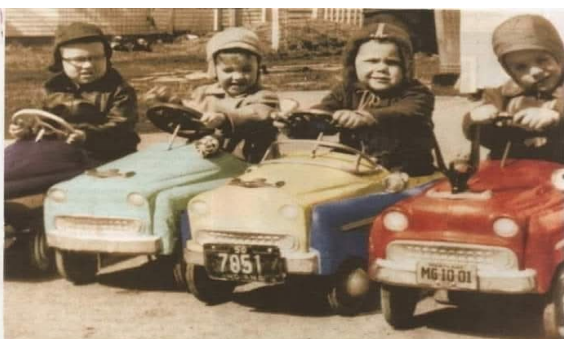
First Hot Rod Club