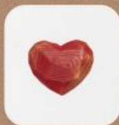
Red Heart 3.5 cm x 3.0 cm