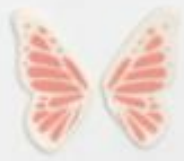
Butterfly Wing Blanc 4.0 cm x 2.0 cm