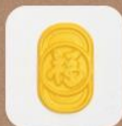
Gold 'FU' Tablet 4.5 cm x 3.0 cm