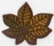
Maple Nior 4.8 cm x 5.5 cm