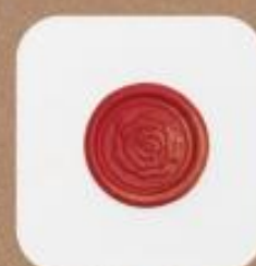
Stamp Rose 3.8 cm x 3.8 cm