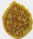
Leaf Vert 5.0 cm x 3.8 cm