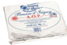
AOP UNSALTED PASTRY BUTTER 1KG SHEET 1KG X 10 SHEETS *INDENT BASIS