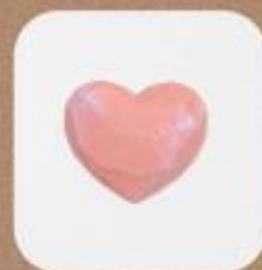
Pink Heart 3.5 cm x 3.0 cm