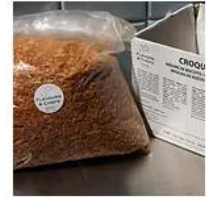
CROQUETINE CRISPY WAFFLES 2KG SNIW141033 2KG X 1 BOX