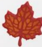
Maple Rouge 4.8 cm x 5.5 cm