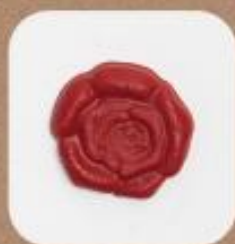
Rose 3.5 cm x 3.0 cm