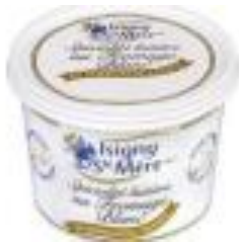
FROMAGE FRAÏCHE LONG LIFE 40% ISM 4052 500G X 6 / CTN INDENT