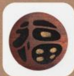
'FU' Round Approximately 4.5 cm