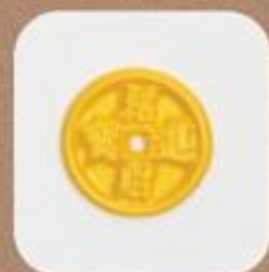
Gold Coin 3.0 cm x 3.0 cm