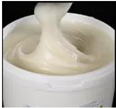
TRIMOLINE (INVERTED SUGAR) 7KG SNIW42217125 7KG X 1 TUB