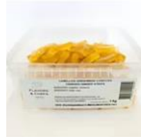
CANDIED GINGER STICKS 1KG SNIW142214 1KG X 1 TUB