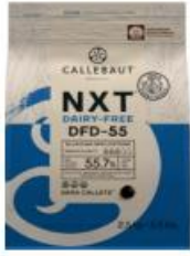
CALLEBAUT NXT DARK CACCHDQ55DFR2BU75 2.5KG X 4 BAGS