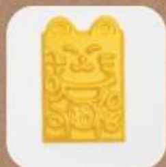
Gold Lucky Cat 4.5 cm x 2.6 cm