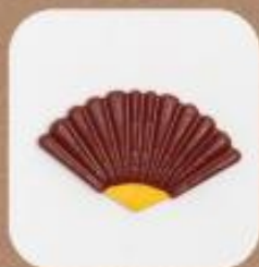
Blessing Fan 5.0 cm x 3.0 cm