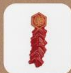
Fire Cracker 5.0 cm x 1.5 cm