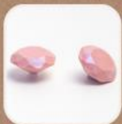
Love Diamond 2.2 cm x 3.0 cm