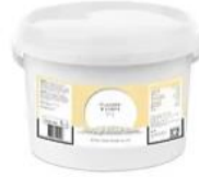
WHITE MIRROE GLAZE 5KG INDENT/TBA 5KG X 1 TUB