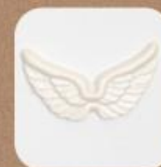
Angel Wing 4.0 cm x 2.5 cm