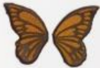
Butterfly Wing Nior 4.0 cm x 2.0 cm