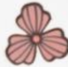
Pinky Flower 4.8 cm x 5.0 cm