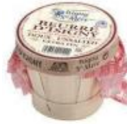
AOP UNSALTED BUTTER WOODEN BASKET 250G ISM 2128 250G X 6 / CTN