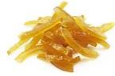
CANDIED LEMON STICKS 1KG SNIW142009 1KG X 1 TUB