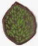
Leaf Nior 5.0 cm x 3.8 cm