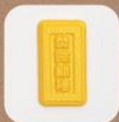
Gold Plate 4.5 cm x 2.6 cm