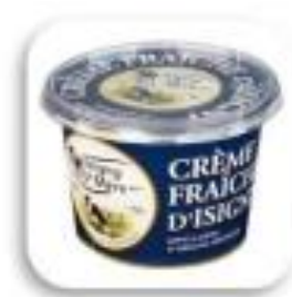
CRÈME FRAÏCHE AOP 35% ISM 1011 200ML X 12 / CTN INDENT