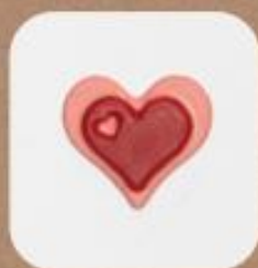
Love Too 3.0 cm x 3.0 cm