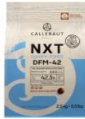
CALLEBAUT NXT MLK CACCHMQ42DFR2BU75 2.5KG X 4 BAGS