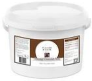
DARK CHOCOLATE GLAZE 5KG SNIW141002 5KG X 1 TUB