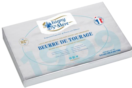
UNSALTED PASTRY BUTTER 1KG SHEET ISM 2782 1KG X 10 SHEETS