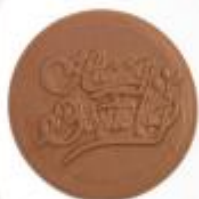
Happy Birthday Round