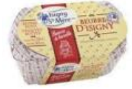
AOP UNSALTED CHURN BUTTER 250G ISM 2512 250G X 20 / CTN