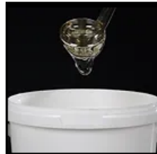
GLUCOSE SYRUP 7KG SNIW142924 7KG X 1 TUB