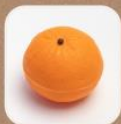
3D Mandarin Orange Approximately 3.0 cm