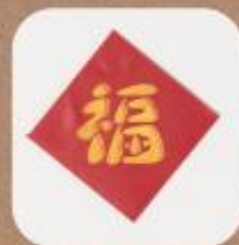
'FU' Red Paper 3.5 cm x 5.0 cm