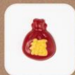
Lucky Bag 3.0 cm x 2.5 cm