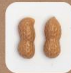
Peanut 4.0 cm x 1.2 cm