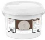
DARK CHOCOLATE GLAZE 5KG INDENT/TBA 5KG X 1 TUB