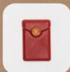
Red Packet 3.5 cm x 2.2 cm