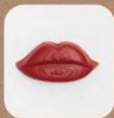
Hot Lips 3.5 cm x 1.5 cm