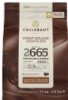
2665 MILK CHOCOLATE 32.9% CALLETS™ CAC.2665-E4-U71 2.5KGX8BAG