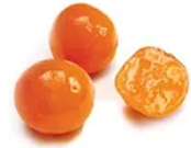
CANDIED WHOLE CLEMENTINE 1KG SNIW142061 1KG X 1 TUB