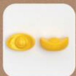
Gold Ingot 3.8 cm x 1.5 cm