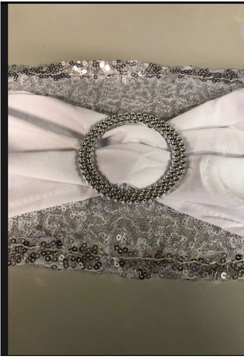
THIS SASH IS REVERSABLE WHITE AND GRAY