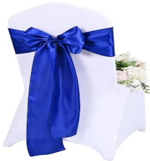
ROYAL BLUE SATIN BOW WITH WHITE CHAIR COVER