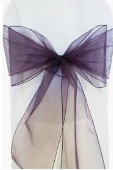
DARK PURPLE ORGANZA