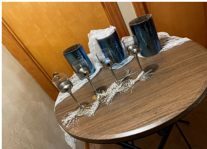
THREE BLUE GLASS CANDLE HOLDERS SIX LONG STEM GLASS CANDLE HOLDERS