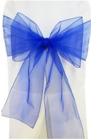
ROYAL BLUE ORGANZA