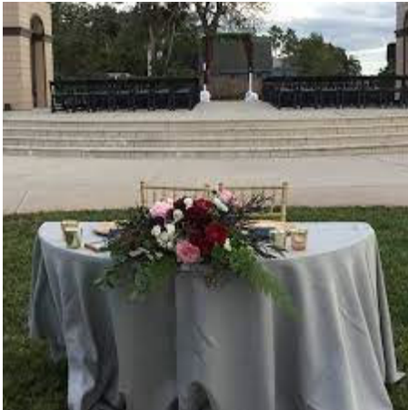
5.5 FOOT 1/2 ROUND SWEETHEART TABLE