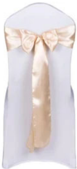
SATIN CHAMPNE BOW/SASH

*IF YOU HAVE A CERTAIN COLOR THAT IS NOT LISTED LET ME KNOW. I WILL TRY TO GET YOUR COLOR!