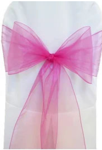
ROSE RED ORGANZA