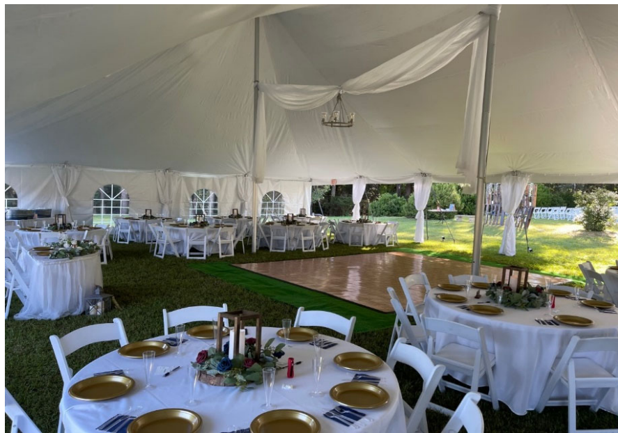
60 INCH ROUND RESIN TABLE