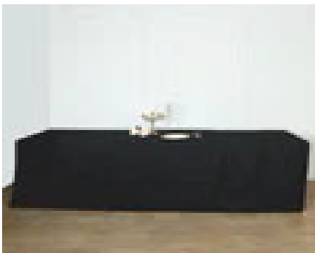
8 FOOT RECTANGULAR TABLE