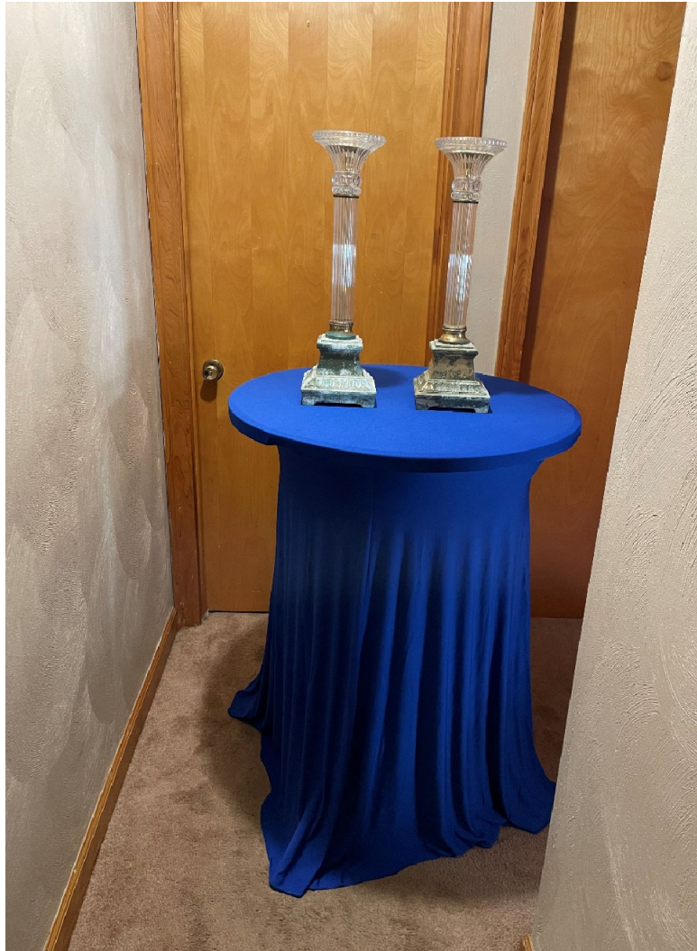
2 CRYSTAL AND BRASS ANTIQUE TALL CANDLE HOLDERS WITH PETINA ON TALL COCKTAIL TABLE WITH STRAIGHT NAVY BLUE TABLECLOTH