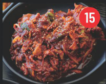
Daeji Bulgogi 🌶️ Spicy Pork Bulgogi