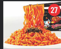
Buldak Ramen 🌶️ Stir-fried Noodle with Fried Egg