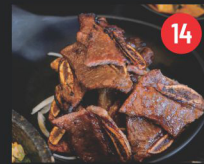
Galbi Marinated Short Rib