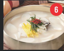
Theok Guk Rice Cake Soup