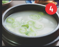
Sul Lung Tang Beef Soup