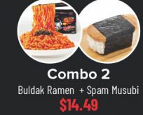
Combo 2 Buldak Ramen + Spam Musubi $14.49