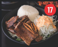
Galbi Plate Marinated Short Rib Plate