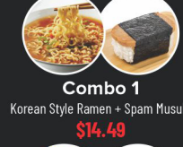
Combo 1 Korean Style Ramen + Spam Musubi $14.49