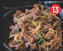
Bulgogi Marinated (Beef) Bulgogi