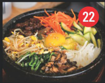
Galbi Dolsot Bibimbap Short Rib Hot Stone