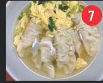
Man Du Guk Dumpling Soup