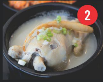
Sam Gye Tang Ginseng Chicken Soup