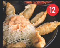
Gun Mandu Fried Pork Dumpling