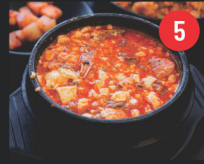
Soon Tofu 🌶️ Spicy Soft Tofu Soup (Seafood, Beef)