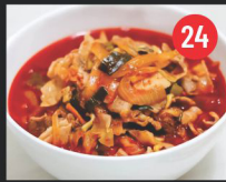
Jjamppong Ramen 🌶️ Seafood Ramen