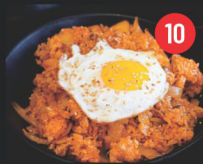
Kimchi Bokkeum-bap Kimchi Fried Rice