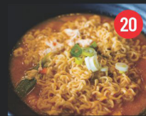
Ramen 🌶️ Korean Style Ramen