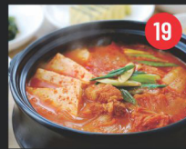
Kimchi Jjigae 🌶️ Kimchi Stew with Pork