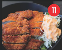
Donkatsu Pork Cutlet