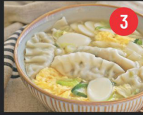
Theok Mandu Soup Dumpling & Rice Cake Soup