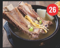
Galbi Tang Beef Short Rib Soup