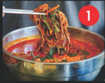
Yuk Gae Jang 🌶️ Spicy Beef Soup

*Please let your server know of any food allergies. Consuming raw or undercooked meats, poultry, seafood, shellfish, or egg may increase your risk of foodborne illness, especially if you have certain medical conditions. Photos may vary from actual food.