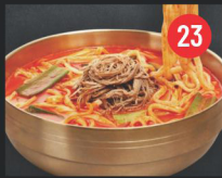
Yuk Kal Myun Original YuK Gae Jang with Fresh Noodle