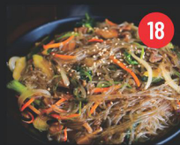
Jap Chae Stir-fried Glass Noodle w. Beef & Vegetables