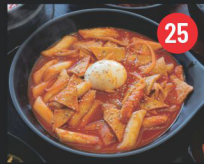
Theok Bokki 🌶️ Spicy Rice Cakes