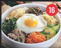
Bibimbap Rice with Fried Egg, Beef and Assorted Vegetables