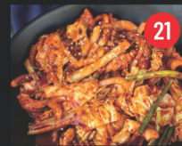
Ojingeo Bokkeum 🌶️ Stir-fried Spicy Squid