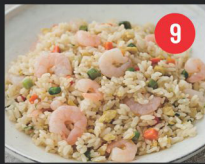
Saewoo Bokkeum-bap Shrimp Fried Rice