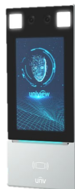
7" Tablet Screen