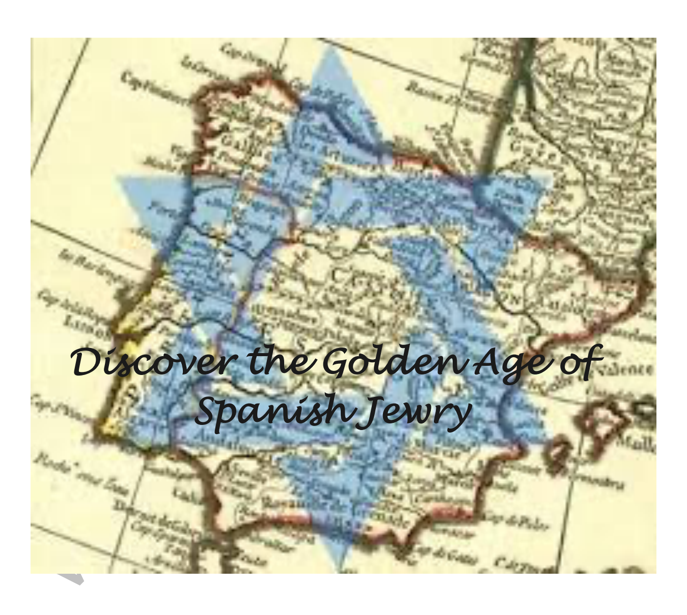
A 9 days/8 nights Jewish Heritage Journey throughout Spain October 18<sup>th</sup> - 26<sup>th</sup> 2023 (optional 3-days extension to Barcelona October 26<sup>th</sup> - 29<sup>th</sup> 2023)