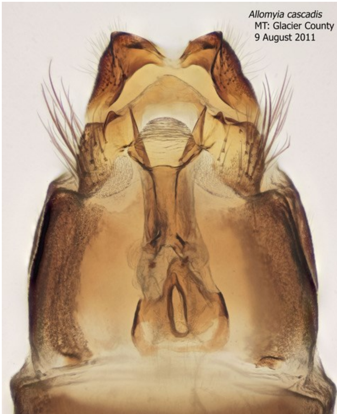
Allomyia cascadis female genitalia, ventral view. An example of Dave Ruiters' photograph technique.

Over 20 years ago Dave embarked on a quest to associate females of all western North American caddisfly species. He felt strongly that examining female genital morphology was essential to systematic studies and for taxonomic clarification of species. To document and record female genitalia, Dave perfected digital imaging techniques. His digital imaging efforts also included male genitalia of many species and some on larval morphology. A catalogue of his images is being prepared for posting on Trichoptera Nearctica for all researchers to use freely with acknowledgement.