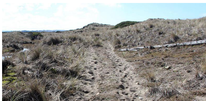
Figure 1: Looking south along the foredune trail where Meloe franciscanus was seen. The actual area for both sightings was near the dead log seen on the right hand side of the trail.