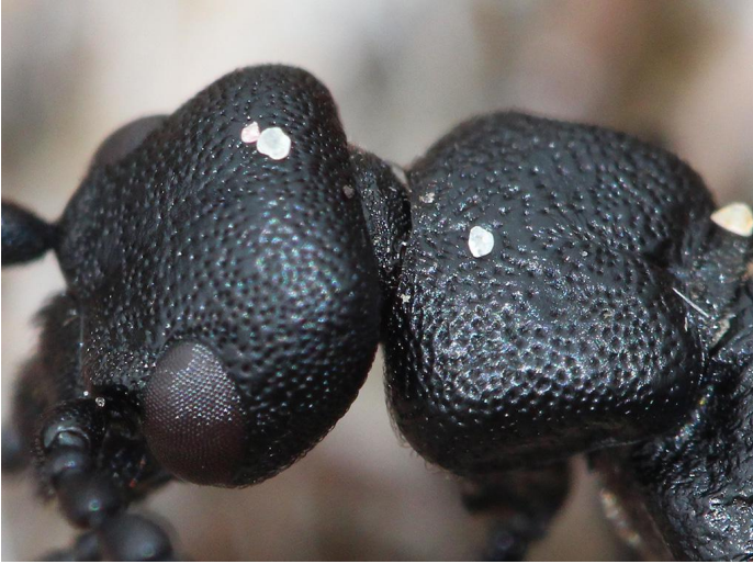
Figure 3. Close-up of the head and thorax of the Meloe franciscanus individual shown in Figure 2.