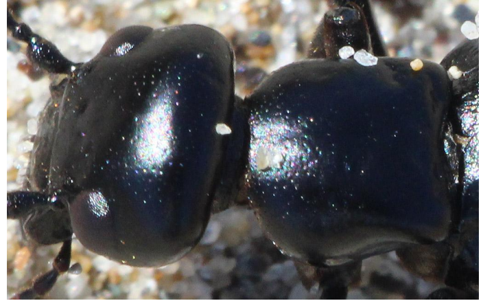
Figure 4. Close-up of the head and thorax of Meloe strigulosus photographed in Bullards Beach State Park, April 30, 2018. Note the differences between this area of Meloe strigulosus compared to the same area of Meloe franciscanus .