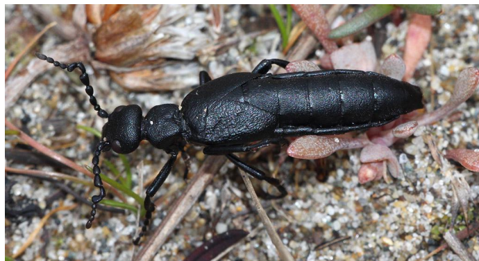
Figure 2. Meloe franciscanus 10 March 2018.