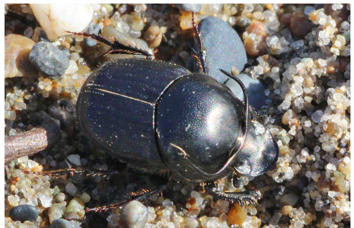
Major male form of Onthophagus taurus photographed 2018 February 5 in Coos County, Oregon at Bullards Beach State Park.

Adventive Onthophagus Latreille (Coleoptera: Scarabaeidae) in North America. The Coleopterists Bulletin 55(1): 49–50. (Download the PDF from < http://listserv.unl.edu/cgi-bin/wa?A3=ind1202B&L=SCARABS-L&E=base64&P=703744&B=-_006_585F164C9C1CDA4BBE6B626B8205DB361874F92287dmnsexmbx1mus_&T=application%2Fpdf;%20name=%22MacRae.pdf%22&N=MacRae.pdf&attachment=q >.)