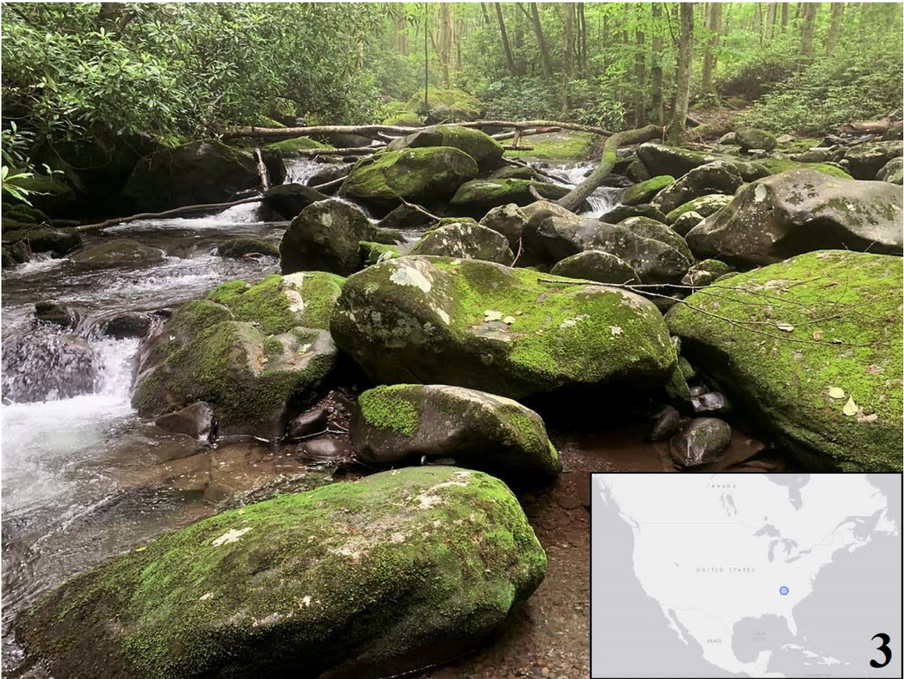
FIGURE 3. Sams Creek in Great Smoky Mountains National Park, Blount County, Tennessee, USA, on 5 June 2020, a representative habitat and collection site of Polycentropus dinkinsorum n. sp. Inset is a map of North America indicating site position (circle).