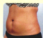
2 months after one procedure