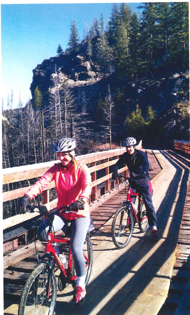
Okanagan Wine Country Cycle Tour