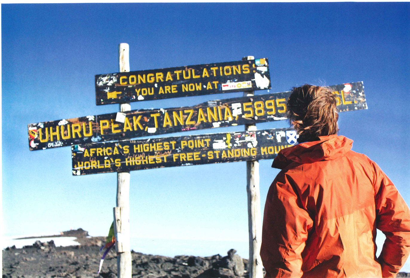
Summit of Mt. Kilimanjaro