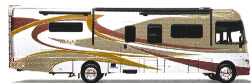
Class A Motorhome