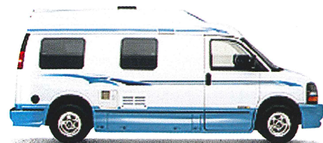
Van Conversion Motorhome