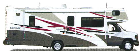
Class C Motorhome