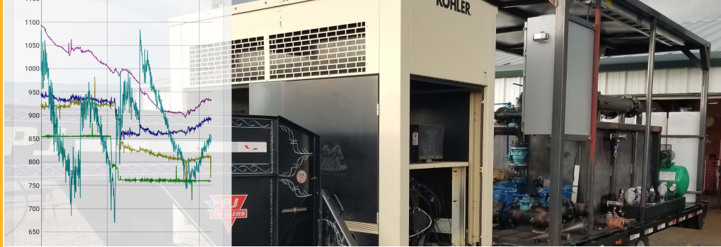
Chemical Injection Unit with Nucleus Display up to the minute on your handheld

The days of dumping a 5 gallon bucket into an agitated tank are over! Proprietary state of the art equipment allowing us to provide our customers with autonomous mixing/injection units.