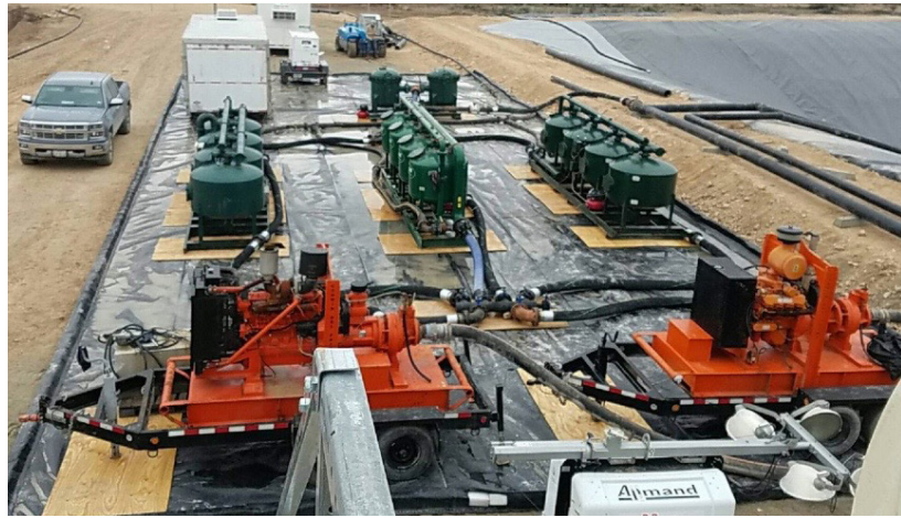
Water filtration and chemical treatment on-site

Our technical team has a deep understanding of produced and flow back water chemistry and can help you design and integrate the right combination of technologies for your needs. We scale solutions to deliver both mobile and permanent assets for centralized water processing.