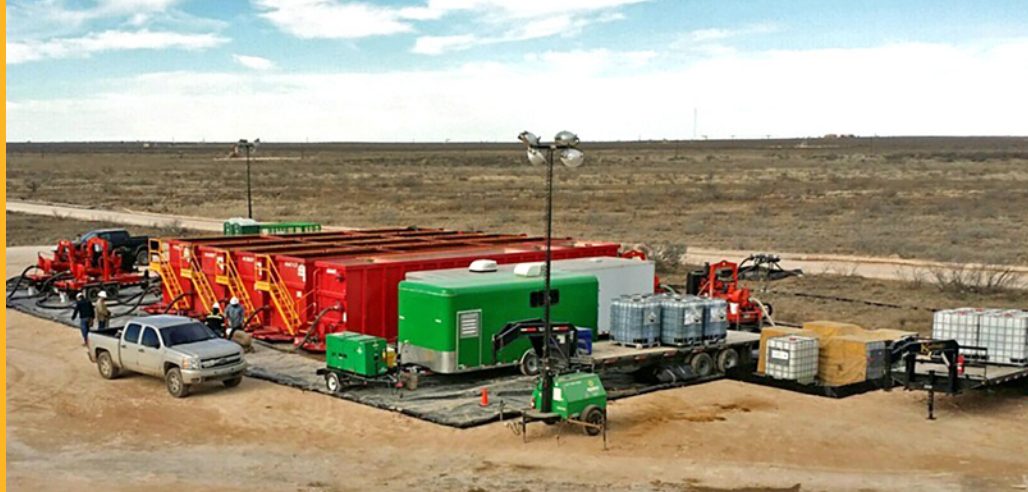
Chemical water treatment in field operations