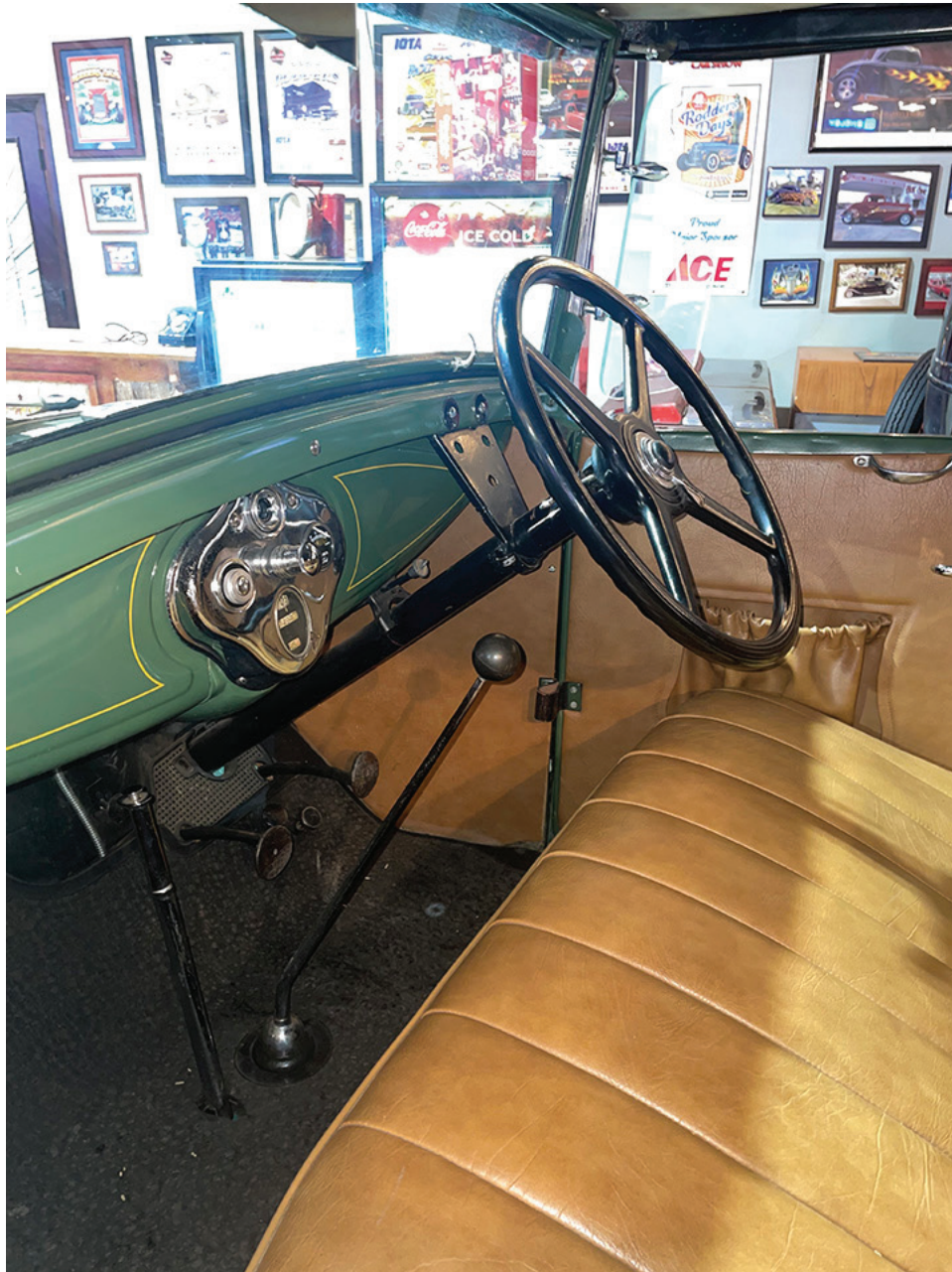
A view of the interior from the left side of the car, which clearly shows the right-hand-drive controls; essentially a mirror image of the left-hand side of an American-made Model A. Note, however, that the parking brake lever is on the left side of the transmission lever, not on the right-hand side.