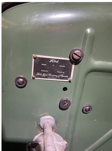
Firewall plaque showing where this Model A was made.

The Canadian-built 1930 Model A Ford predominantly displayed at the Tucson Auto Museum. Behind it is another rare Ford, a Model Y Tudor sedan. This car was designed in Dearborn, but built in Europe, and took the place of the Model A. The Model Y is a very small car, much smaller, even, than the Model A, and that's exactly why it was produced. The Model A was too big for the European market.