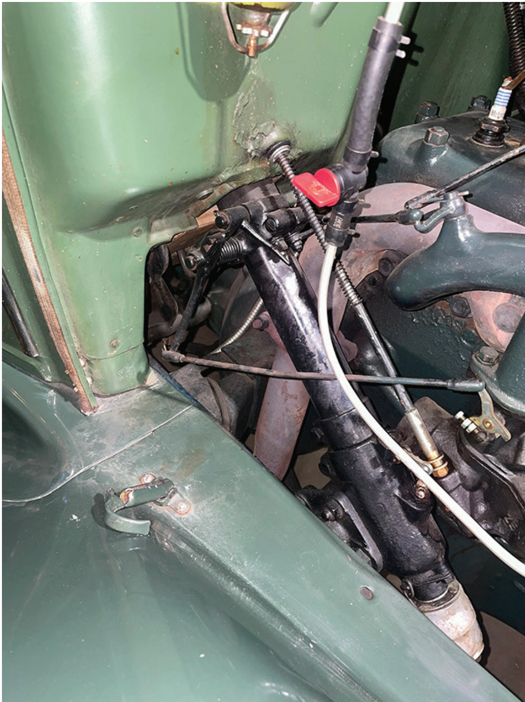
Another view of the engine compartment showing how the right-hand controls are fitted.