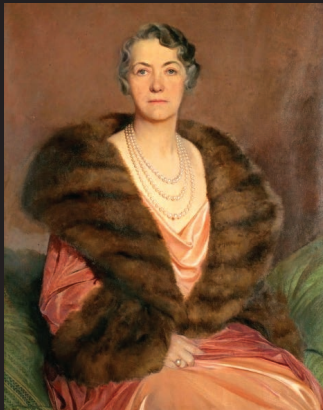
Anna Dodge 1866-1970

Anna may have gotten her inspiration from Edsel Ford, who had built quite a fabulous mansion some 7 years earlier. We'll take a look at Edsel's Gaukler Pointe mansion in the next newsletter.