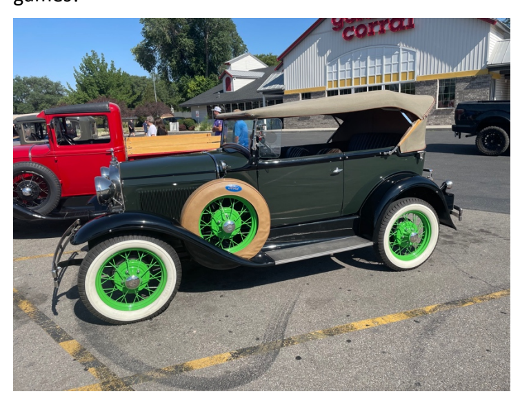
Following the parade we went to Golden Coral in Ogden for lunch. We arrived shortly after 10 and they don't

We, unfortunately, had to be right behind two horse groups who wanted us to not honk the ahooga horns. Model A's, parades and no ahooga horns honking? You may as well ask us not to breathe. Anyway, we tried hard not to honk too much, but once we separated a bit we got a few in. The other benefit of being behind the horses is we got to practice maneuvering around the resulting road apples to prepare us for the upcoming car games!