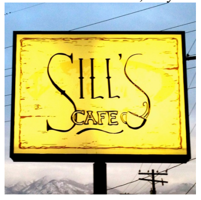
Beehive A's Rumble Seat Review, July 2022