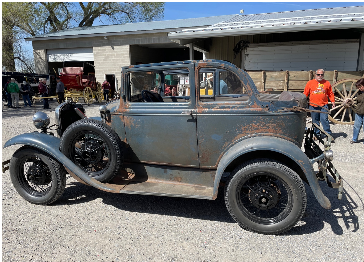
Henry Dominguez's A400

Beehive A's - The Model A Club of Northern Utah