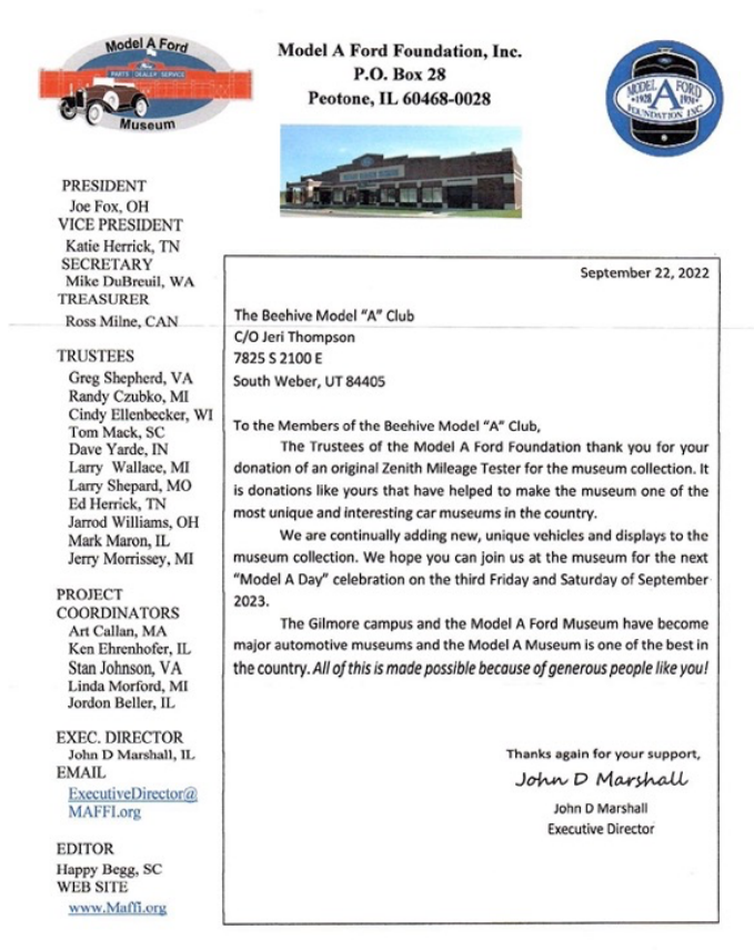
MAFFI is a 50l C3 organization. All Donations are deductible to the limit of the law.