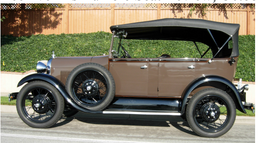
Beehive A's Rumble Seat Review, October 2022

1929 Model A Phaeton. Older, complete off-frame restoration to original stock condition ( with few minor exceptions). Exceptionally sound body and fenders. Engine overhauled several years (and very few miles) ago by Bud Cheney. Runs great. Snyder's 5.5:1 high compression head provides increased