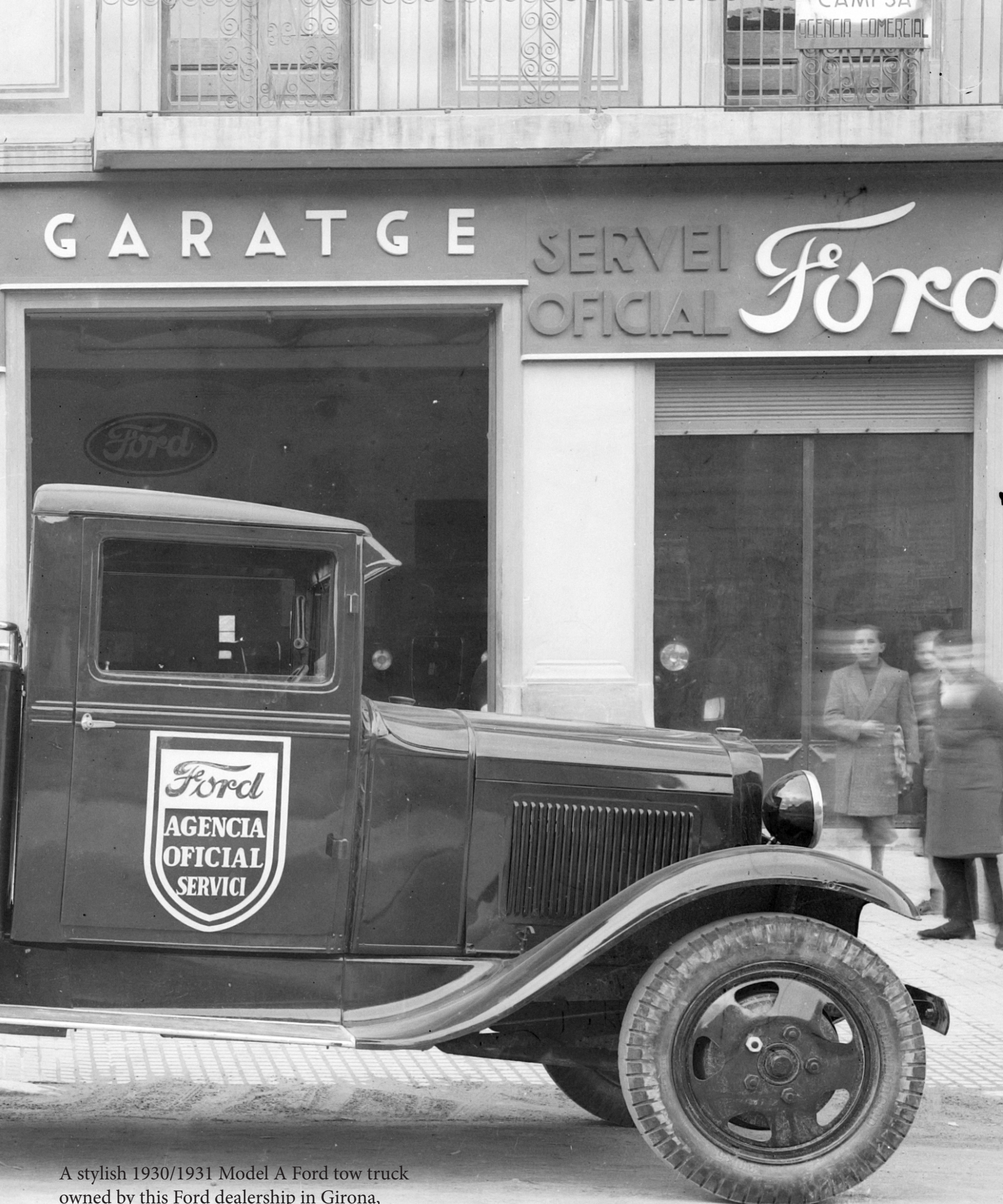
A stylish 1930/1931 Model A Ford tow truck owned by this Ford dealership in Girona, Spain.