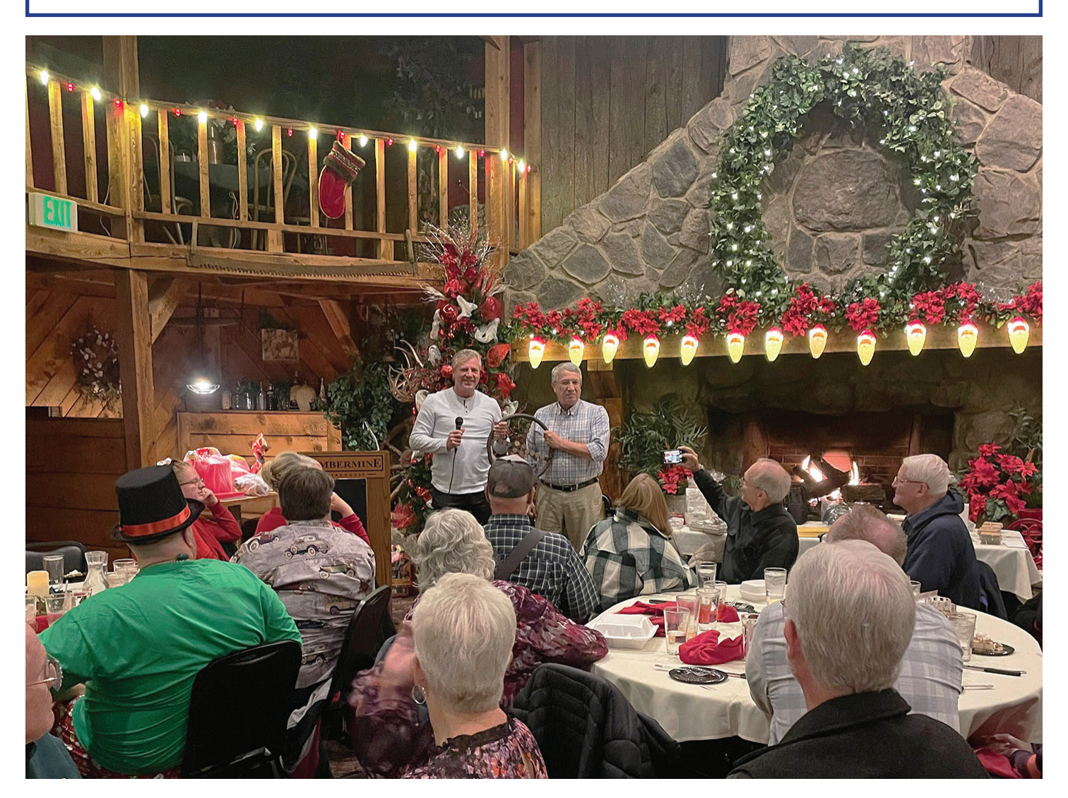
The Beehive A's 42nd Annual Christmas Party!

Beehive A's—The Model A Club of Northern Utah