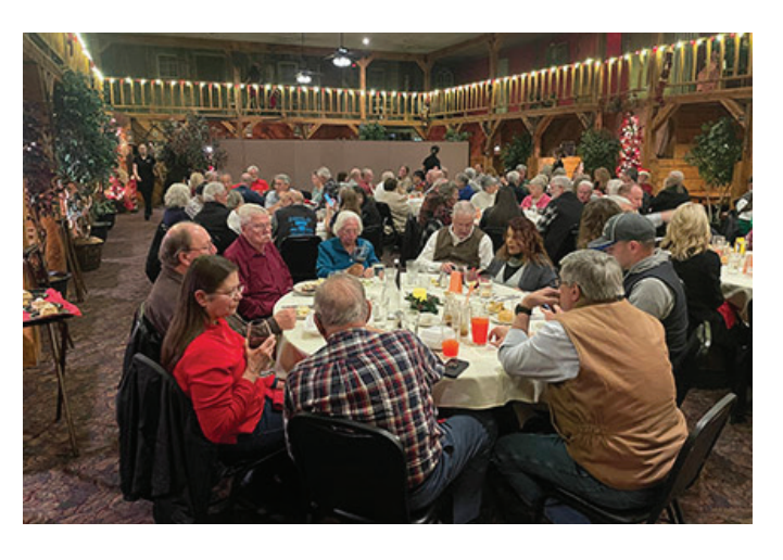
Above and below: The dining room at the Timbermine steakhouse was crowed with Model Aers at the Christmas Party