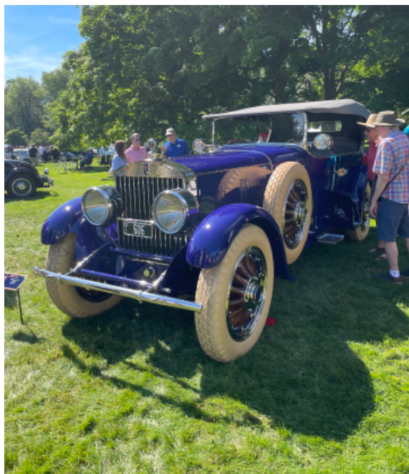
The mystery car on display at the Edsel Ford estate.

Unfortunately, his great fortune came to an end in the early Twenties when he was accused of raping and killing a young starlet. Fatty was acquitted of both crimes, but his movie career was all but over. Fatty Arbuckle died of a heart attack in 1933 at the tender age of 46.