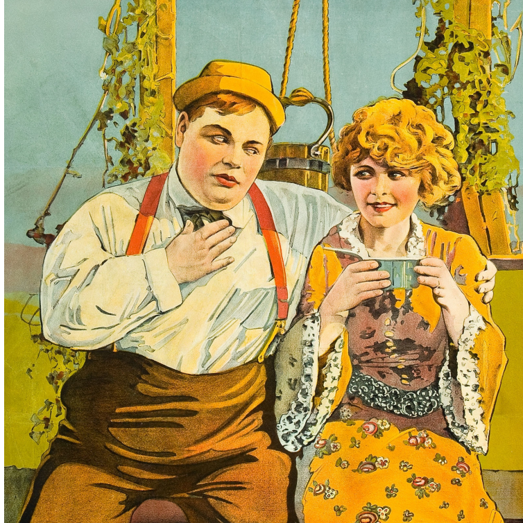
Winifred Westover with Fatty Arbuckle in 1919 film poster for the movie "LOVE."