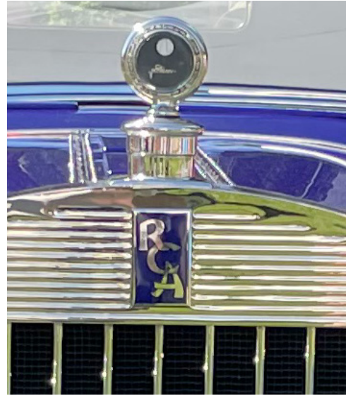
Why are the letters RCA on the radiator shell?