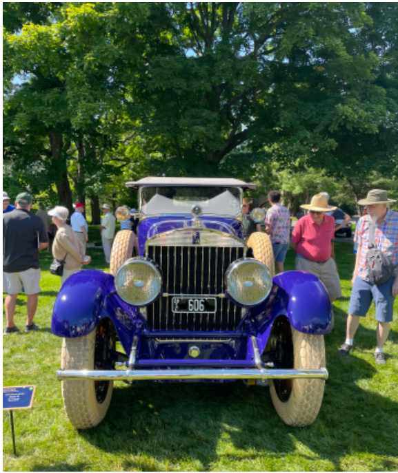
Front view of mystery car showing its massive white tires.