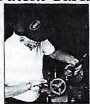
Red E. Power

By removing the glass bowl and doing the following I was able to stop the leak.