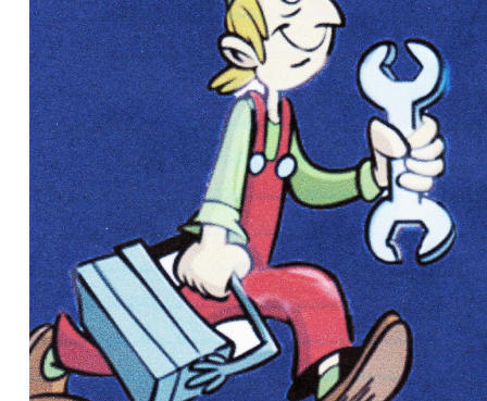
rite Frisco illustrationsOf.com/89401

When this longer bolt is used, it presses against the starter shaft when tight and it messes up the Bendix operation.