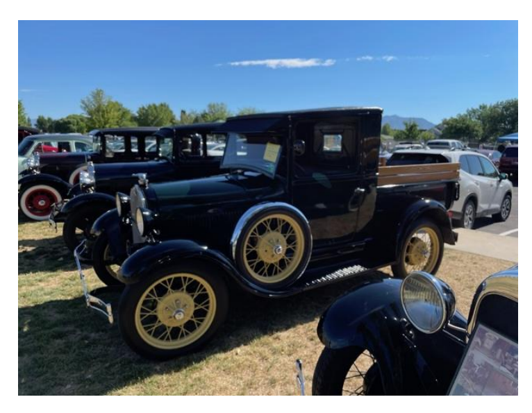
Congratulations to the owners of these fabulous cars.