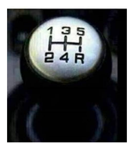
...and you call yourself a car guy.

DeVere Brough's 1931 Model A Sedan is cleaned up and running ready for sale. This is a very nice 4 Door Sedan very well done and very reliable. Asking price is $16,900.00. Call or see Russell Baker for details 801-560-5373