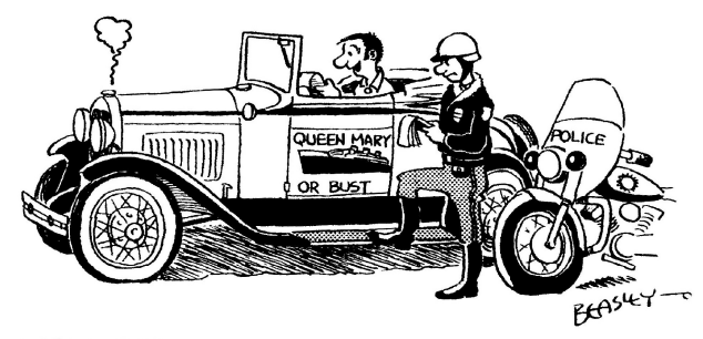
WOW, 75! - WAIT'LL THE GANG BACK AT THE CLUB SEES THIS