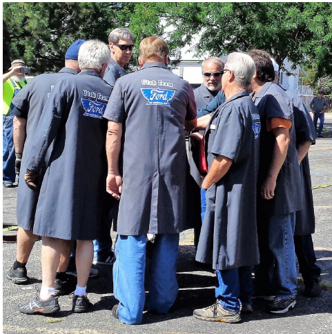
The 'T & A Strippers' do a camaraderie fist bump before each 'T' assembly.