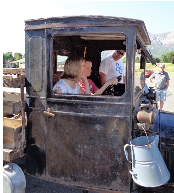
Kids at the youth event drive the 'T'