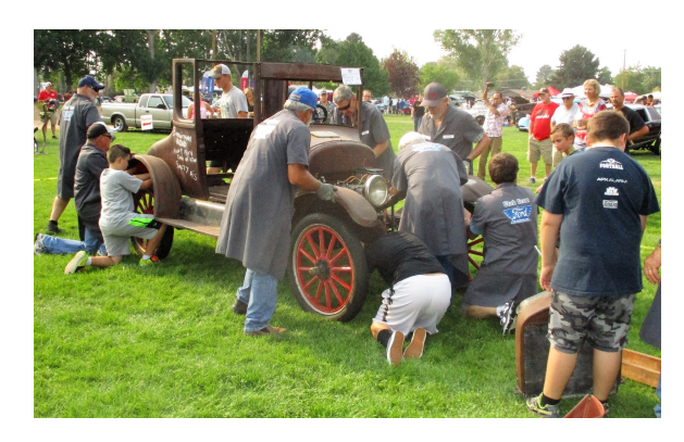
2<sup>nd</sup>. timed assembly with youth involvement: 4:17