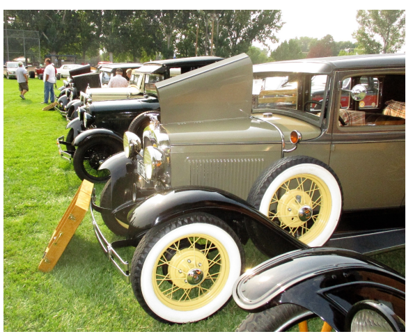
Timed 'T & A' assembly: 3:57