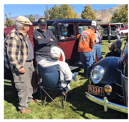
Socializing and relaxing at the car show